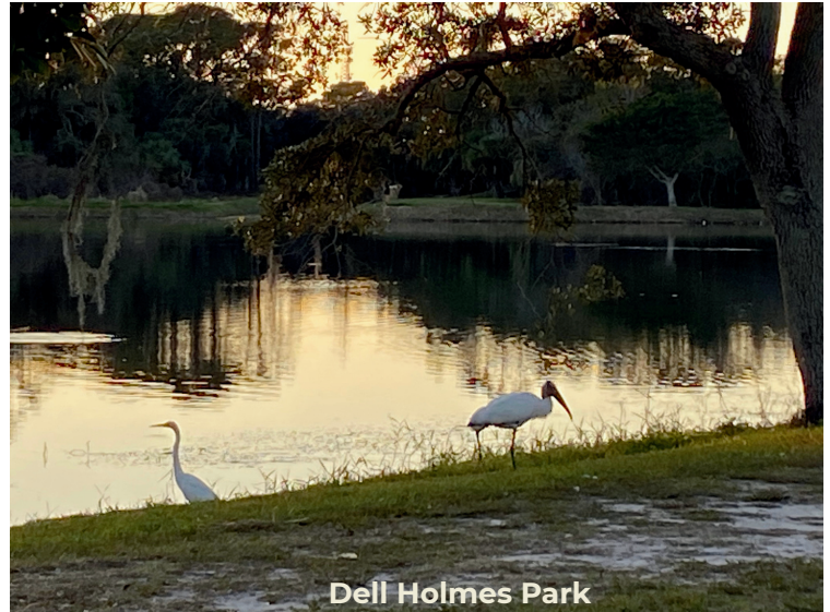
Dell Holmes Park